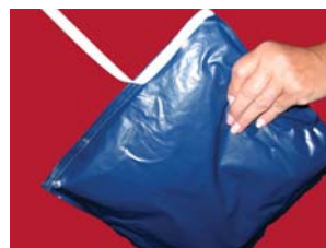
Easy to Reseal