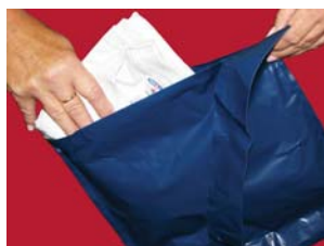
Easy to Repackage