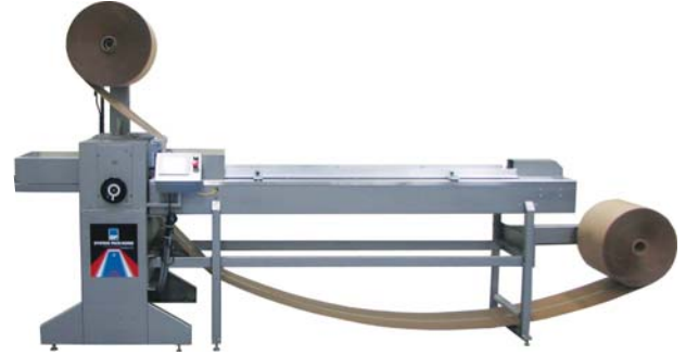
SP 9000 Cold Seal Machine

This machine type accepts a continuous stream of products in varying lengths, and automatically adjusts the package accordingly. This flexibility has made it a popular packaging machine for book publishers & distributors, as well as, catalog & internet fulfillment companies. This is an ideal machine for the packaging of Books, CD's, DVD's, Videos, Software, Clothing, Soft Goods and numerous other products. This system has a production rate of up to 30 packages per minute.