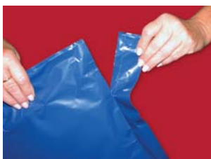
Easy to Open