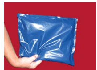
Easy to Return